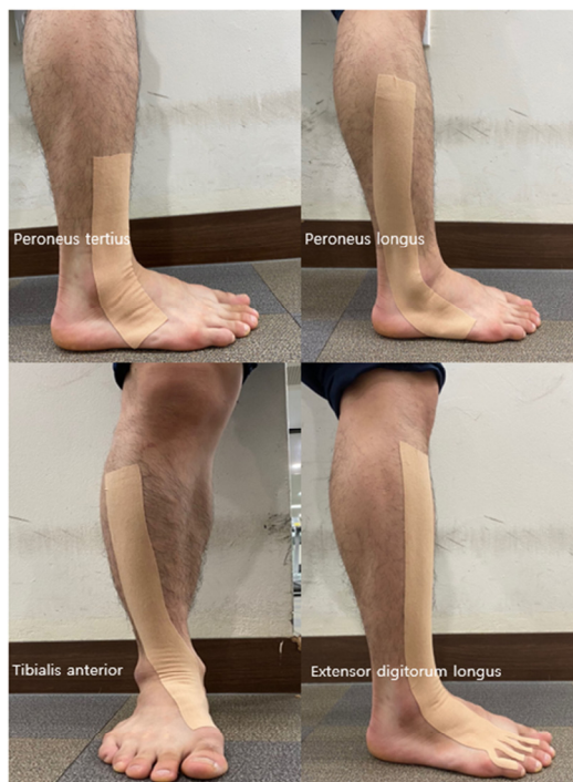
Fig. 1. Taping position applied to the ankle joint on the paralyzed side of a stroke patient.

For taping treadmill training, kinesio tape (Benefact tape, Sigmax, Japan) was used for ankle taping. Kinesio tape is used widely to stabilize the ankle joint during static standing or walking in stroke patients [25]. In this study, the tape was attached to the peroneus tertius, peroneus longus, tibialis anterior, and extensor hallucis longus, which are used widely for ankle joint stability in stroke patients [26,22]. One physical therapist with three years of clinical experience applied the tape at the position where the muscle was maximally elongated. To attach the tape to the peroneus tertius, one end of the tape was fixed to the 5th metatarsal on the paralyzed side with the ankle joint supinated, and was attached to the fibular 1/3 area along the direction of the muscle fiber running. To attach the tape to the peroneus longus, one end was fixed to the base of the first metatarsal with the ankle joint supinated, and was attached to the lateral process of fibular along the direction of the muscle fiber running. To attach the tape to the tibialis anterior, one end was fixed between the big toe and the index toe on the paralyzed side with the ankle joint pronated and was attached to the outside of the knee along the direction of the muscle fiber running. To attach the tape to the extensor digitorum longus, one end of the tape was