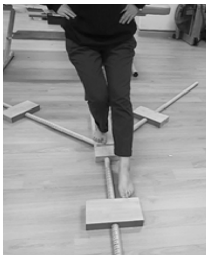
Fig. 3. Y-balance test.

after rest. In preparation for falls during the examination, the examiner waited around the subjects and observed them. The stability index (ST) was used for evaluation, and the static balancing capacity increased with decreasing ST value.