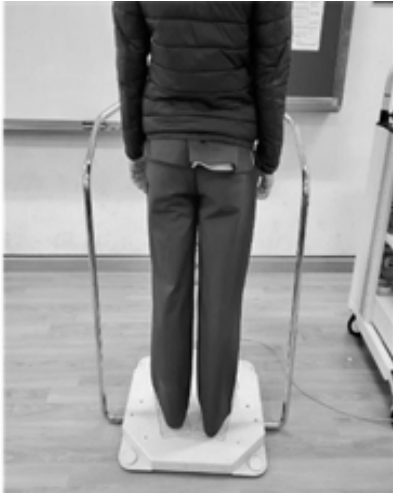
Fig. 2. Tetrax.