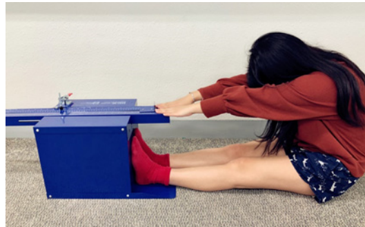
Fig. 2. Experimental posture.