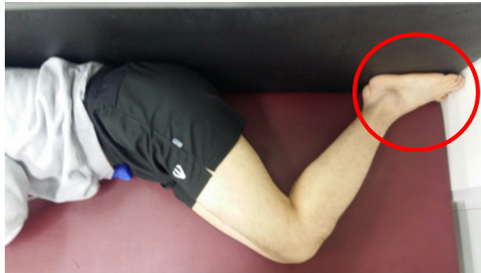
Fig. 2. Modified clamshell exercise (CLAM) 1; the back is in contact with the wall and the feet are pushed at about 10% of the maximal contraction against the wall