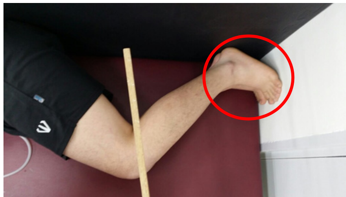
Fig. 3. Modified clamshell exercise (CLAM) 2, both heels and metatarsal heads are pushed at about 10% of the maximal contraction against the wall, while maintaining neutral ankle position

changes in the body's position during the exercise, and has been reported to decrease substitution from the QL and to increase the GMED activity during the side-lying abduction exercise [4]. The stabilizer pressure bio-feedback unit was inflated until the pressure reached 40 mmHg, after which the participant and the investigator (JSG) observed this pressure to ensure that it maintained between 35 and 45 mmHg during the exercises.