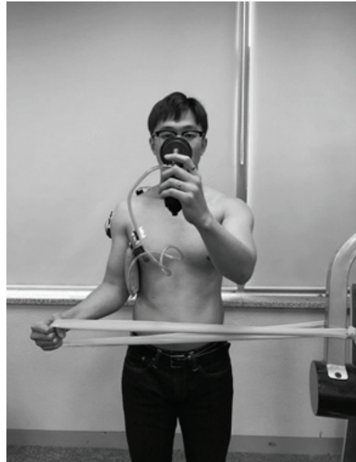
Fig. 1. Experimental posture

Each shoulder test was performed three times with at least 30 seconds of rest between each repetition. The order of the tests was randomized to avoid systematic effects of fatigue. For randomization, sealed envelopes were prepared in advance and marked inside with A, B, or C representing 0 mmHg, 20 mmHg and 40 mmHg, respectively.